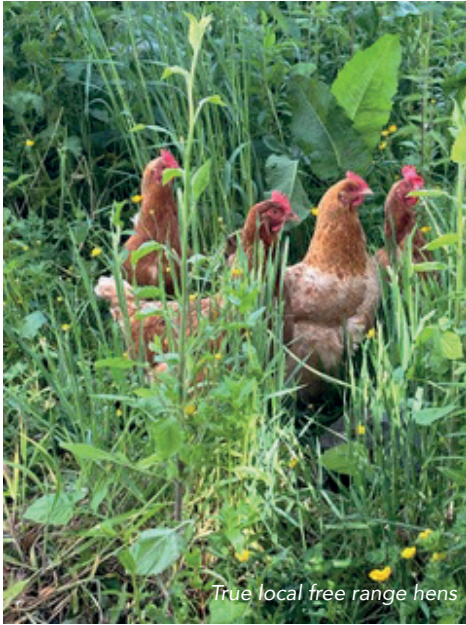
True local free range hens